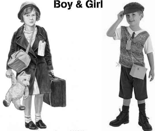
Examples of WW2 evacuees

* Live Music, * Army & Civilian Vehicles, * Vintage Market, * Movie Poster Trail Competition, * Living History/Army Displays * RAF Flypast